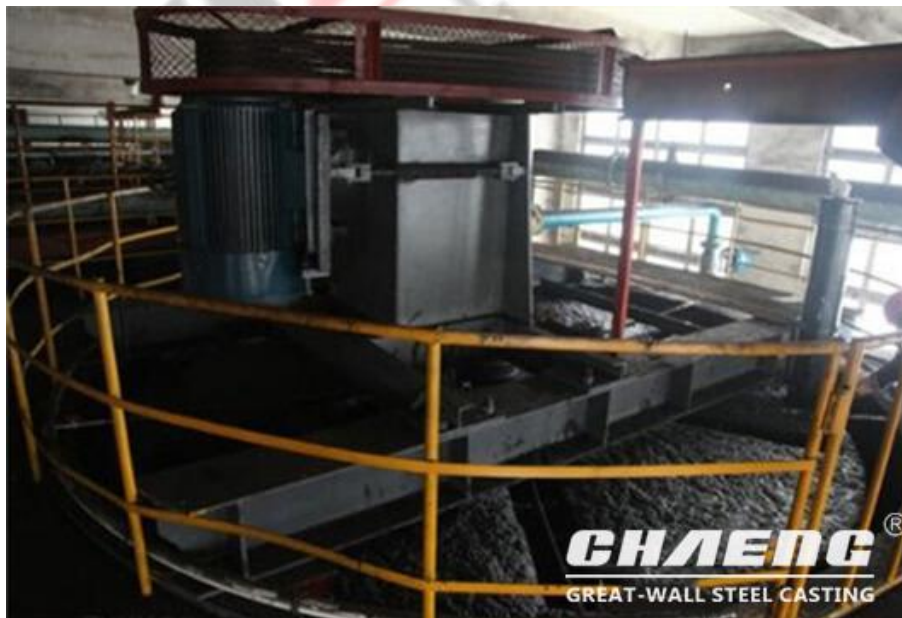
Fig. A ceramic machine manufacturers in Zhejiang uses CHAENG ceramic press crossbeams

One ceramic machine manufacturers in Zhejiang bought crossbeams from CHAENG the main parts of the ceramic machine equipment, the data show that the the ceramic machine is currently running smoothly with large productivity.