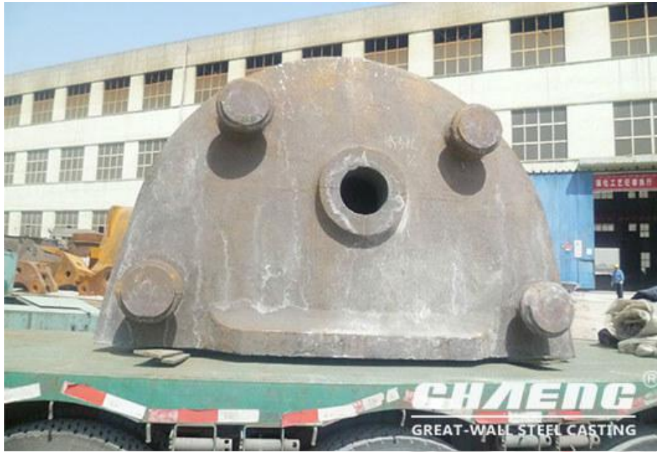
Fig. CHAENG upper and lower crossbeams to Italy

One ceramic machine manufacturers in Zhejiang bought crossbeams from CHAENG the main parts of the ceramic machine equipment, the data show that the the ceramic machine is currently running smoothly with large productivity.