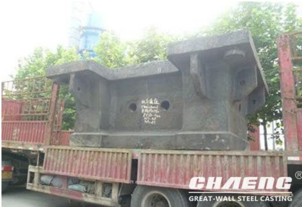
Fig. CHAENG ceramic press base customized for Italian customers