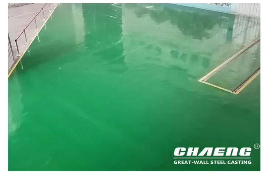
Epoxy floor in the workshop