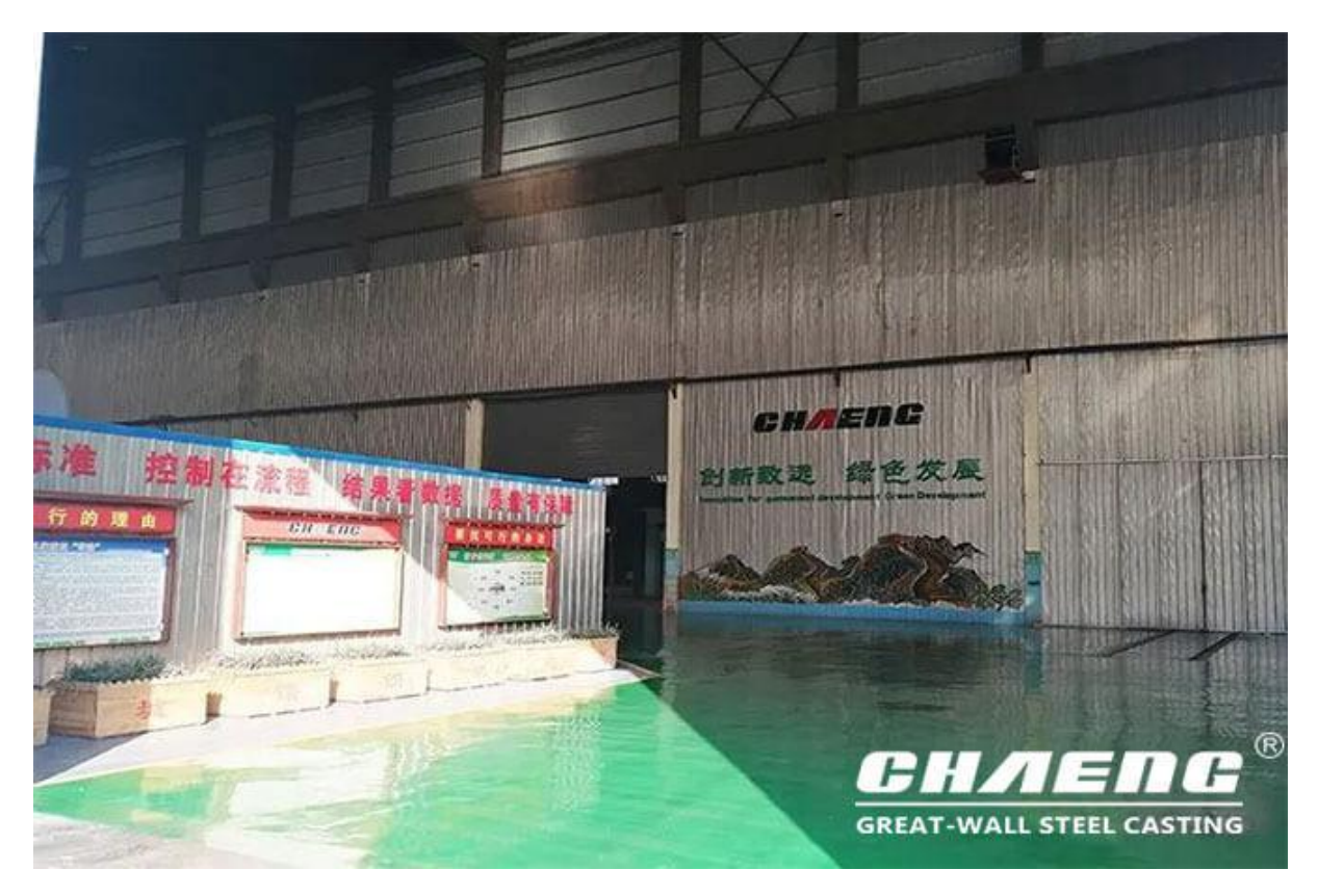
Closed isolation of each process in the workshop

Following the trend of green development of the industry, CHAENG actively explores all aspects of foundry technology, workshop equipment, etc., divides and isolates each functional area of the workshop, introduces environmental protection equipment, and improves production processes, etc. CHAENG has formulated and implemented a series of effective environmental protection measures.