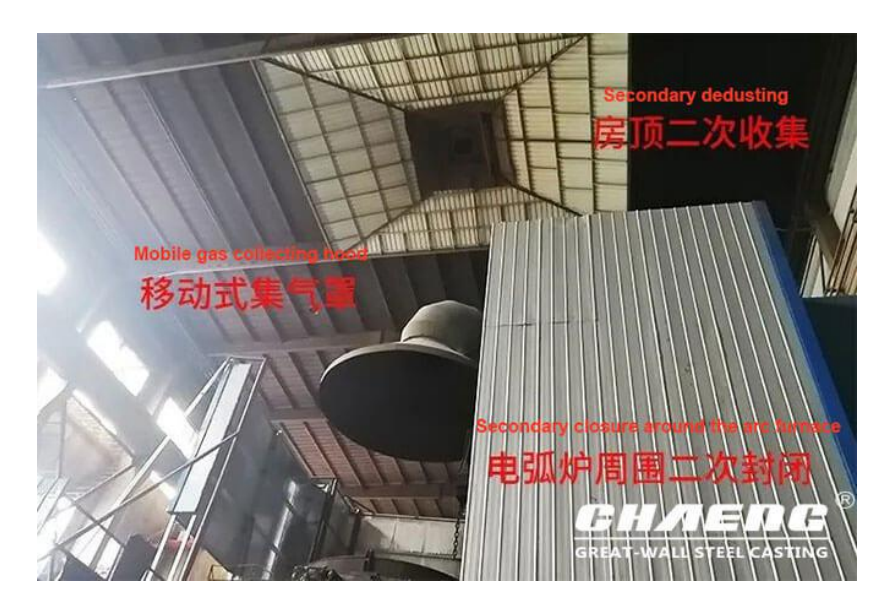
Environmental protection facilities in production workshop