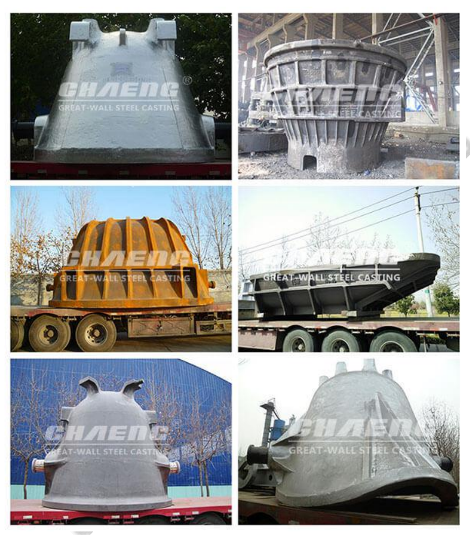
CHAENG (Great Wall Steel Casting Co., Ltd)

CAHENG slag pots are exported to Belgium, Brazil, the United States, Finland, the Netherlands, Japan, Germany, India, South Korea, Thailand, Mexico, South Africa, Chile, Italy, Brazil, France, Austria and other countries. And CHAENG has Long-term cooperation with international large steel companies such as Mittal, TATA, VAI, and Baosteel. These rich cases are a strong proof of the superior quality of CHAENG slag pots.