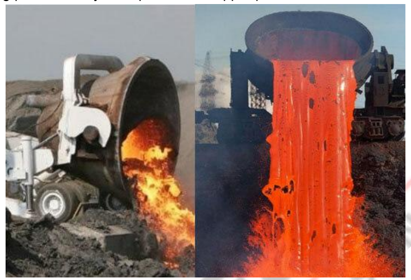
Then why so many enterprises choose CHAENG casting slag pots?

The slag pot is mainly used in the blast furnace, the converter, and the refining workshop to hold the high-temperature slag generated during the iron and steel smelting process. CHAENG has been specialized in the production of steel casting slag pots for many years, providing more than 50 types of high quality slag pots for many steel plants and copper plants at home and abroad.